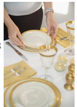
'Wandsworth PCT is Selling off the family silver'

Let Wandsworth PCT know what you think about their short term squandering of our assets